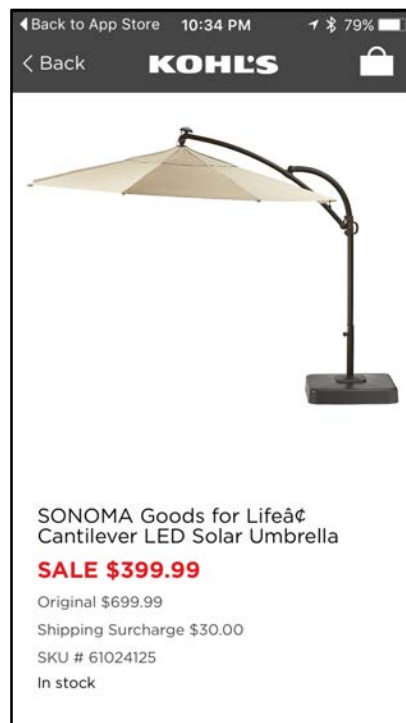
Figure 3 – “Sonoma Goods for Life Cantilever LED Solar Umbrella” at Kohl’s iPhone app (accessed 4/4/16)